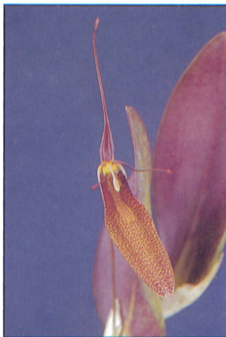
R. radulifera Luer & R. Escobar

Vegetatively this species is similar to many of the medium-sized species of the genus with an ovate leaf. Near the apex of the leaf a large flower with a long, narrow, spotted synsepal is held. The synsepal is orange-brown with the dark brown spots disappearing toward the apex. The long, narrow, pandurate lip is most distinctive, the narrowly oblong epichile being covered by minute spicules.