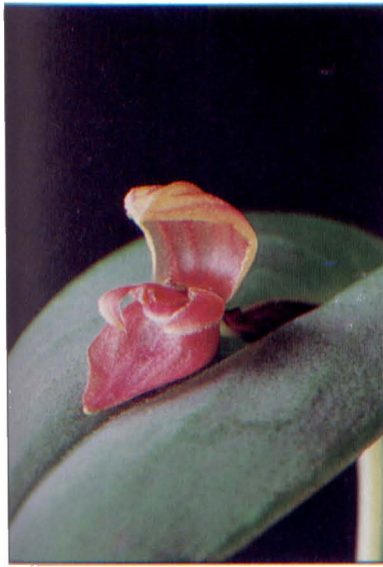
5. PLEUROTHALLIS CASSIDATA