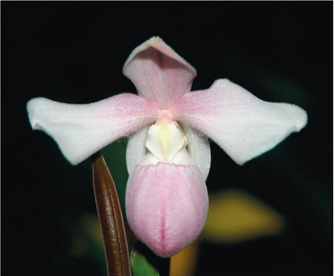
Fig. 2. Phragmipedium andreettae P.J.Cribb & Pupulin. Frontal view of the flower that served as the holotype ( Portilla s.n. , QCA).