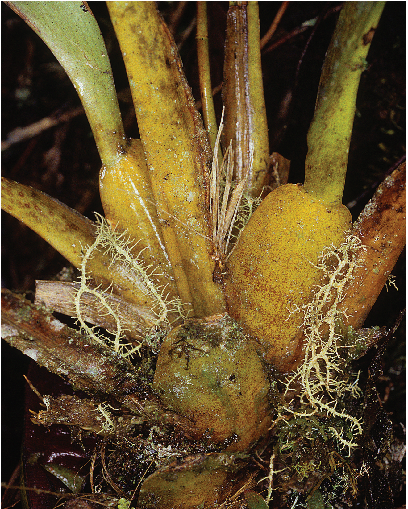
FIGURE 4. Odontoglossum tipuloides (Rchb.f.) Dalström & W.E.Higgins (based on S. Dalström 2358 (SEL)).