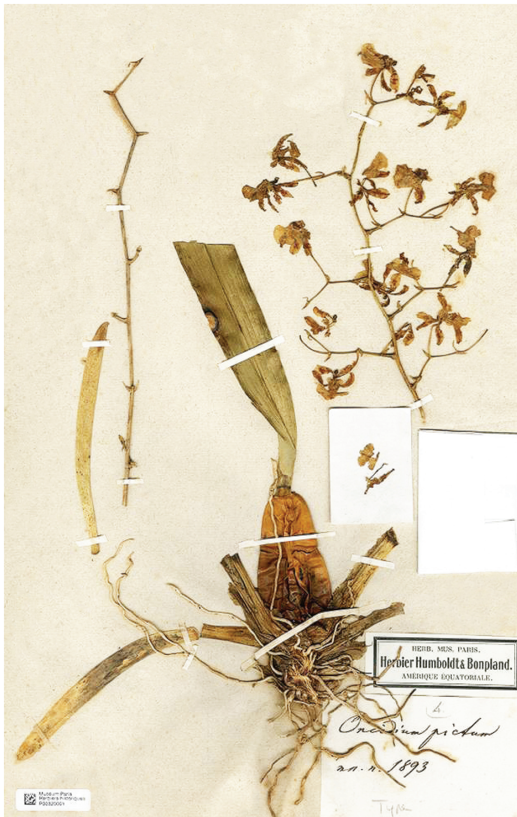
FIGURE 3. Oncidium pictum Kunth. Holotype (P).