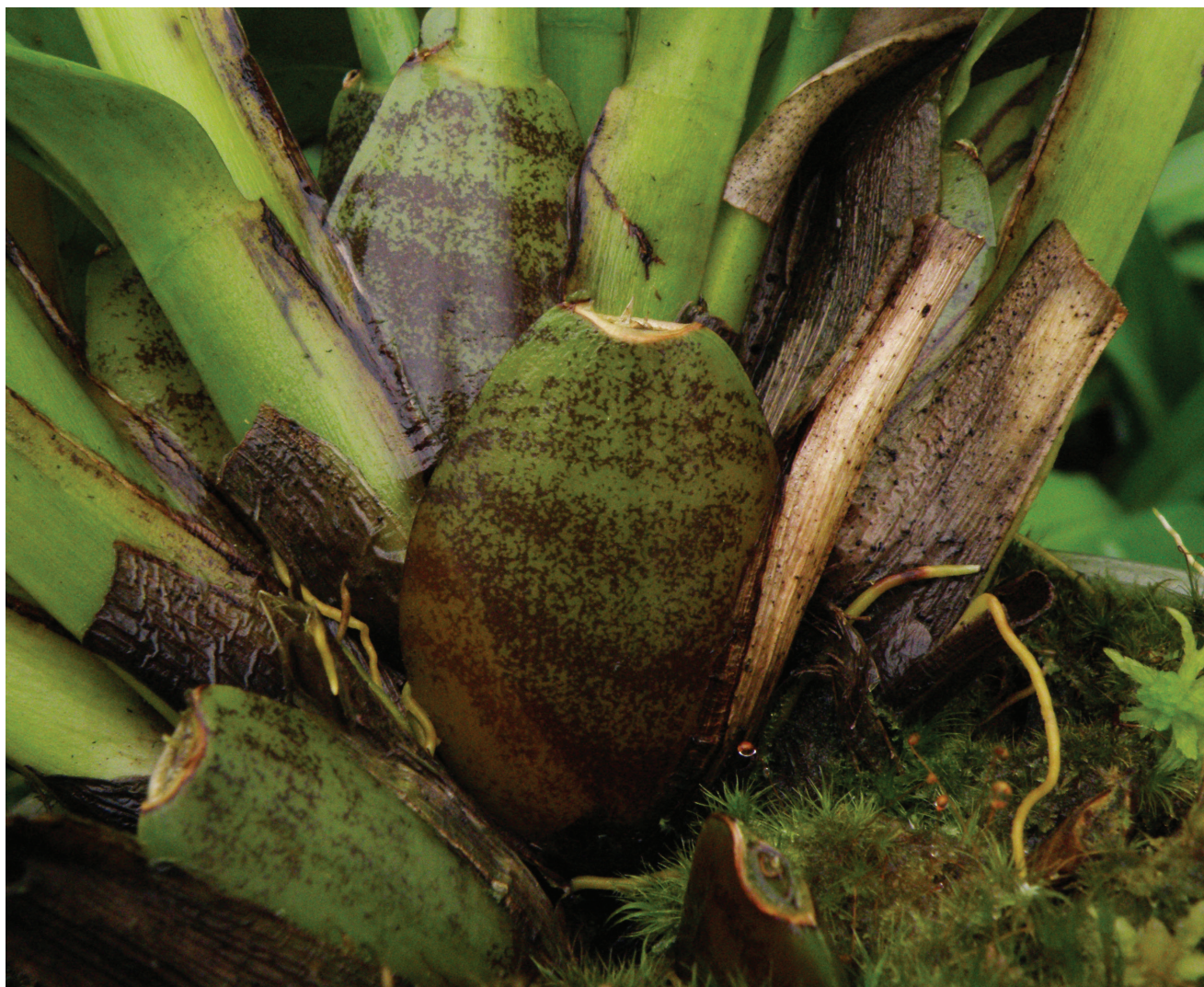
FIGURE 2. Odontoglossum boothianum (Rchb.f.) Dalström & W.E.Higgins (based on S. Dalström 3716 (USM)). Photograph by Stig Dalström.

No DNA sample of this species is known to us or has appeared in any published phylogenetic analysis, but it may prove to be an older name for O. obryzatum . The illustration of Odontoglossum pictum (as “ Oncidium ”) that appears in the original publication (Kunth 1816: t. 81) shows a bifoliate pseudobulb. The type specimen in Paris from which the drawing is made has a unifoliate pseudobulb (Fig. 3), however, which appears to be typical for this group of species.