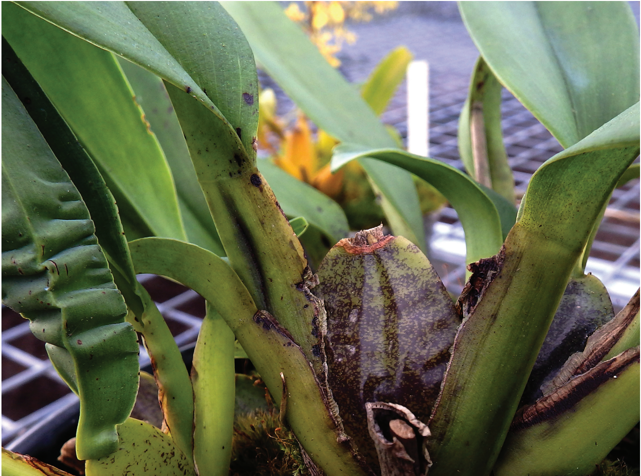
FIGURE 5. Odontoglossum zelenkoanum (Dressler & Pupulin) Dalström & W.E.Higgins (based on S. Dalström 3791 (USM)).